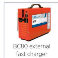
BC80 external fast charger

Typical power plant:* DC regional jets and turboprop airline operations PT6C-67, TPE 331-12, RR Dart 356, RR AE3007A, PW121, PW127, PW150A, ALF 502, CF34B, BR710, or power plants of a similar specification