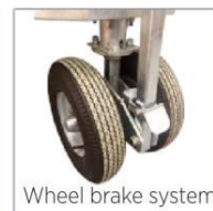
Wheel brake system