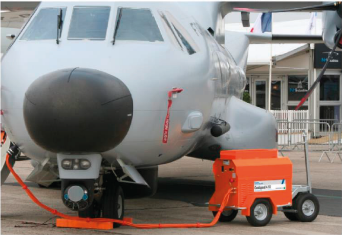
Coolspool 410: in operation on CASA 235