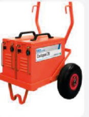
Coolspool 29 Twin