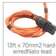
13ft x 70mm 2 hard-wired NATO lead