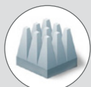
Microwave SEA-PM & TM