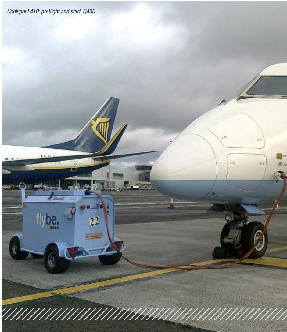
Coolspool 410: preflight and start, Q400