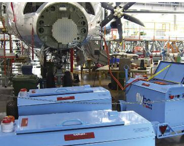
Coolspool 580: Q400 – supplying power during heavy maintenance