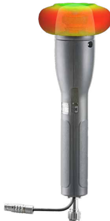
Fig. 2. 3591/02 Omnidirectional