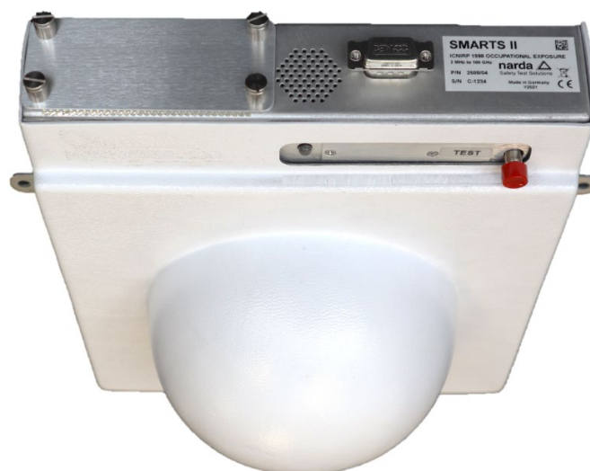
Fig. 1. SMARTS II on ceiling

The alarm threshold is field adjustable from 10% of standard to 50% of standard. The user can easily switch from battery operation to an external, low voltage DC supply.