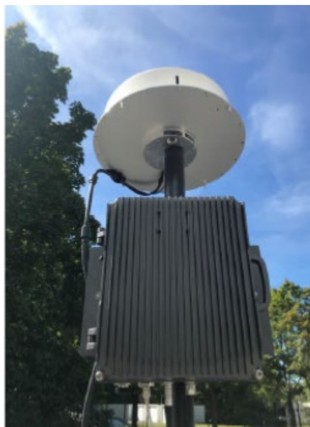
Fig. 1. The SignalShark Outdoor Unit and Automatic DF antenna for AoA and TDOA.

Different versions of the "SignalShark Outdoor Unit Modem" are available depending on the region in which the device is to be used, taking into account the respective mobile radio frequency range. Your local Narda sales representative will be happy to assist you in the selection of the right version.