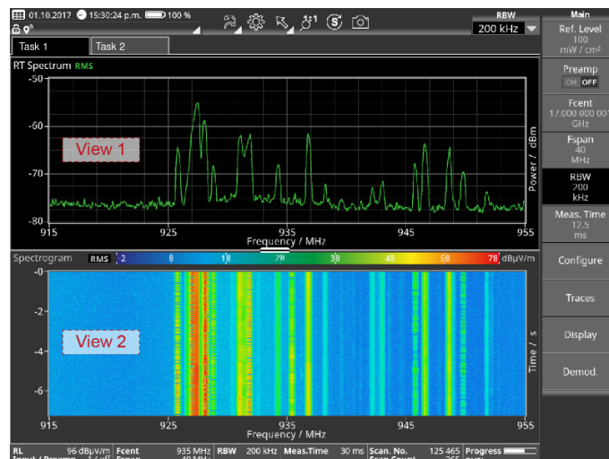
Fig. 2. RT Spectrum view (View 1) and Spectrogram view (View 2) in a task (Task 2)

Real-Time Spectrum mode enables spectrum measurements with a frequency span of up to 40 MHz in real-time. All frequencies within the frequency span are acquired simultaneously with no time gaps and with a FFT frame overlap of 75%. The FFT frame overlap increases to 87.5% for frequency spans of 20 MHz or less. A second digital down converter is used at the same time for analyzing and demodulating the I/Q data of a separate channel within the 40 MHz real-time bandwidth. The frequency and bandwidth of this channel are selectable.