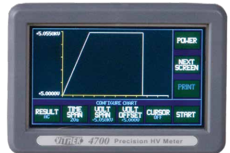
Chart Mode automatically plots voltage readings from a few seconds to several days. Highly useful for determining ramp linearity, overshoot and sag on hipot testers and other HV sources.

Automate your HV test requirement with the 4700's built-in Ethernet port, high speed serial communication port or available GPIB. The 4700 is fully programmable—so you can select your measurement mode and bandwidth, then take readings as often as desired. The 4700 also comes standard with a USB printer port, to capture readings and get hardcopy printouts of HV plots—so you can document the sag or overshoot in a typical hipot test.