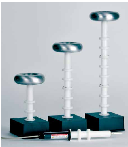
HVL Series High Performance Lab Grade, HV-SmartProbes™ shown above in 35KV, 70KV and 100KV models. Handheld HVP-35 portable HV-SmartProbes™ shown with detachable probe tip.

Vitretek's 4700 precisely measures voltages directly up to 10KV, right out of the box—with no external probes. That's high enough for most of the HV sources out there. However, should you care to expand your high voltage measurement range—just add one or more of the available 35KV, 70KV, 100KV and 150KV SmartProbes™. The Vitrek SmartProbes™ each store their own calibration data which is down loaded when they are plugged in to the 4700—this results in high accuracy, calibrated readings and allows any Vitrek SmartProbe™ to be used with any 4700 HV Meter. The SmartProbe's™ proprietary, ultra-low TC attenuator design minimizes self-heating—while its low capacitance technology enhances AC